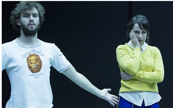
First published on 24 Aug 2011. Updated on 30 Aug 2012.